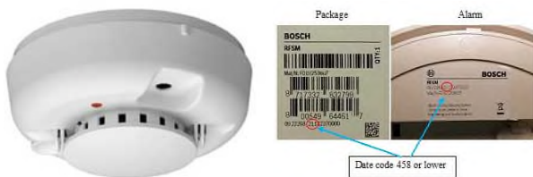
Recalled Bosch Security Systems Radion Wireless Smoke Alarm

To report a dangerous product or a product-related injury go online to www.SaferProducts.gov or call CPSC's Hotline at 800-638-2772 or teletypewriter at 301-595-7054 for the hearing impaired. Consumers can obtain news release and recall information at www.cpsc.gov , on Twitter @USCPSC or by subscribing to CPSC's free e-mail newsletters .