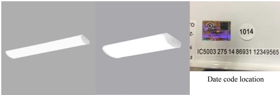
Decorative end wrap light fixtures