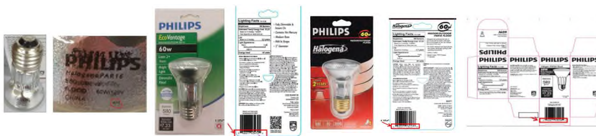
Actual lamp with etch position Philips EcoVantage Halogen Lamp Packaging (front and back)

To report a dangerous product or a product-related injury go online to www.SaferProducts.gov or call CPSC's Hotline at 800-638-2772 or teletypewriter at 301-595-7054 for the hearing impaired. Consumers can obtain news release and recall information at www.cpsc.gov , on Twitter @USCPSC or by subscribing to CPSC's free e-mail newsletters .