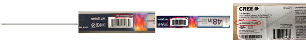
Cree® LED T8 Lamp

To report a dangerous product or a product-related injury go online to www.SaferProducts.gov or call CPSC's Hotline at (800) 638-2772 or teletypewriter at (301) 595-7054 for the hearing impaired. Consumers can obtain news release and recall information at www.cpsc.gov , on Twitter @USCPSC or by subscribing to CPSC's free e-mail newsletters .