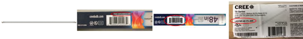
Cree® LED T8 Lamp

To report a dangerous product or a product-related injury go online to www.SaferProducts.gov or call CPSC's Hotline at (800) 638-2772 or teletypewriter at (301) 595-7054 for the hearing impaired. Consumers can obtain news release and recall information at www.cpsc.gov , on Twitter @USCPSC or by subscribing to CPSC's free e-mail newsletters .