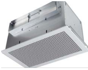
Broan-NuTone L500 Ventilation Fans