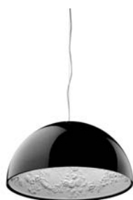
Recalled Flos Skygarden pendant light fixtures

To report a dangerous product or a product-related injury go online to www.SaferProducts.gov or call CPSC's Hotline at 800-638-2772 or teletypewriter at 301-595-7054 for the hearing impaired. Consumers can obtain news release and recall information at www.cpsc.gov , on Twitter @USCPSC or by subscribing to CPSC's free e-mail newsletters .