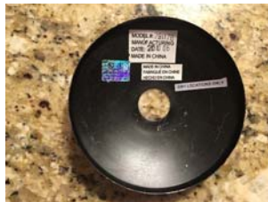
Canopy with model number