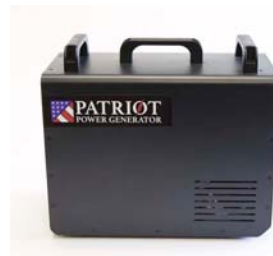
Patriot Power Generator (side view)