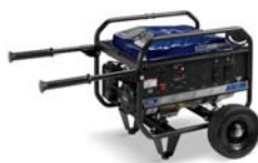
Kohler PRO3.7 Portable Generator

To report a dangerous product or a product-related injury go online to www.SaferProducts.gov or call CPSC's Hotline at 800-638-2772 or teletypewriter at 301-595-7054 for the hearing impaired. Consumers can obtain news release and recall information at www.cpsc.gov , on Twitter @USCPSC or by subscribing to CPSC's free e-mail newsletters .