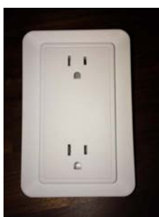
Room Sensor (Front)

To report a dangerous product or a product-related injury go online to www.SaferProducts.gov or call CPSC's Hotline at 800-638-2772 or teletypewriter at 301-595-7054 for the hearing impaired. Consumers can obtain news release and recall information at www.cpsc.gov , on Twitter @USCPSC or by subscribing to CPSC's free e-mail newsletters .