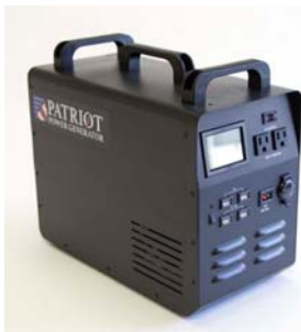
1,500 Watt Patriot Power Generator

To report a dangerous product or a product-related injury go online to www.SaferProducts.gov or call CPSC's Hotline at 800-638-2772 or teletypewriter at 301-595-7054 for the hearing impaired. Consumers can obtain news release and recall information at www.cpsc.gov , on Twitter @USCPSC or by subscribing to CPSC's free e-mail newsletters .