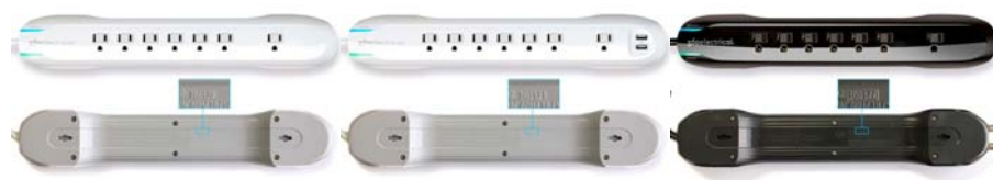
Idealist surge protector, model number 360320

To report a dangerous product or a product-related injury go online to www.SaferProducts.gov or call CPSC's Hotline at 800-638-2772 or teletypewriter at 301-595-7054 for the hearing impaired. Consumers can obtain news release and recall information at www.cpsc.gov , on Twitter @USCPSC or by subscribing to CPSC's free e-mail newsletters .