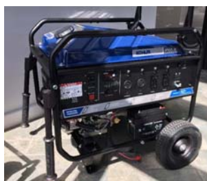
Kohler PRO5.2 Portable Generator