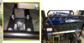
Location of label with model number, serial number, and manufacturing date code