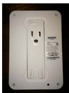
Room Sensor (Back)