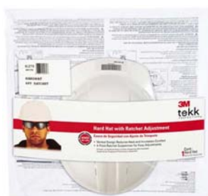
Recalled 3M hard hat