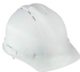
Recalled 3M hard hat

To report a dangerous product or a product-related injury go online to www.SaferProducts.gov or call CPSC's Hotline at 800-638-2772 or teletypewriter at 301-595-7054 for the hearing impaired. Consumers can obtain news release and recall information at www.cpsc.gov , on Twitter @USCPSC or by subscribing to CPSC's free e-mail newsletters .