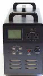
Patriot Power Generators (front panel)