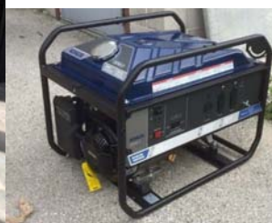
Kohler GEN5.0 Portable Generator