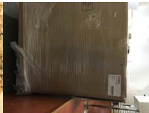
Label with model number on original packaging