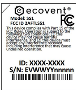
Label on Back of Room Sensors