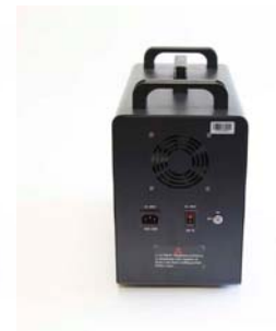
Patriot Power Generator (rear panel)