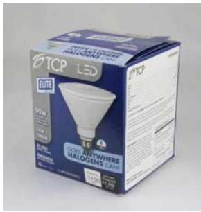
TCP Lamp L14P38D30KFL and L14P38D50KFL in Packaging