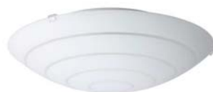
IKEA HYBY ceiling lamp

To report a dangerous product or a product-related injury go online to www.SaferProducts.gov or call CPSC's Hotline at 800-638-2772 or teletypewriter at 301-595-7054 for the hearing impaired. Consumers can obtain news release and recall information at www.cpsc.gov , on Twitter @USCPSC or by subscribing to CPSC's free e-mail newsletters .