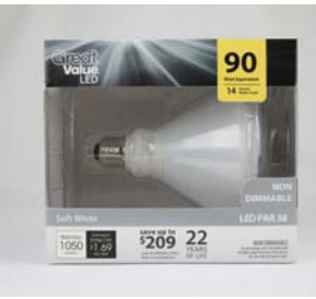
Great Value Lamp GVRLP381430WL in Packaging