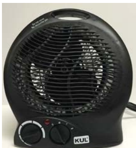
KUL Fan Heater

To report a dangerous product or a product-related injury go online to www.SaferProducts.gov or call CPSC's Hotline at 800-638-2772 or teletypewriter at 301-595-7054 for the hearing impaired. Consumers can obtain news release and recall information at www.cpsc.gov , on Twitter @USCPSC or by subscribing to CPSC's free e-mail newsletters .