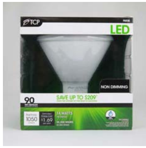
TCP Lamp RPL381430WL in Packaging