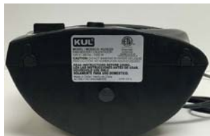
KUL Fan Heater Model Label