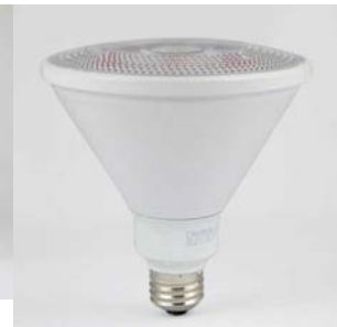
LED 14 watt PAR38 Wet Location Bulb