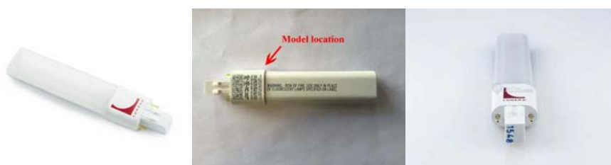
Lunera 13 watt Helen GX23 LED lamp The model appears on the back of the connector. The date code is stamped on the bottom of the connector.

To report a dangerous product or a product-related injury go online to www.SaferProducts.gov or call CPSC's Hotline at 800-638-2772 or teletypewriter at 301-595-7054 for the hearing impaired. Consumers can obtain news release and recall information at www.cpsc.gov , on Twitter @USCPSC or by subscribing to CPSC's free e-mail newsletters .