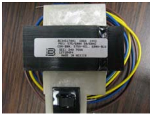
Basler Class 2 electric transformers

To report a dangerous product or a product-related injury go online to www.SaferProducts.gov or call CPSC's Hotline at 800-638-2772 or teletypewriter at 301-595-7054 for the hearing impaired. Consumers can obtain news release and recall information at www.cpsc.gov , on Twitter @USCPSC or by subscribing to CPSC's free e-mail newsletters .