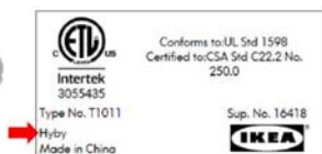
Label attached to the HYBY electrical lamp housing