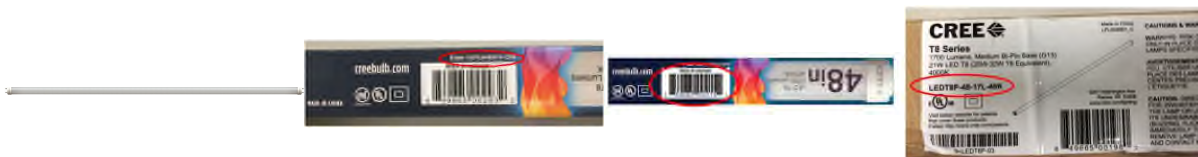
Cree® LED T8 Lamp

To report a dangerous product or a product-related injury go online to www.SaferProducts.gov or call CPSC's Hotline at (800) 638-2772 or teletypewriter at (301) 595-7054 for the hearing impaired. Consumers can obtain news release and recall information at www.cpsc.gov , on Twitter @USCPSC or by subscribing to CPSC's free e-mail newsletters .