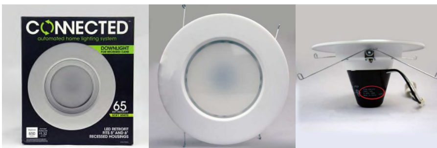
Downlight Bulb in Packaging

To report a dangerous product or a product-related injury go online to www.SaferProducts.gov or call CPSC's Hotline at 800-638-2772 or teletypewriter at 301-595-7054 for the hearing impaired. Consumers can obtain news release and recall information at www.cpsc.gov , on Twitter @USCPSC or by subscribing to CPSC's free e-mail newsletters .