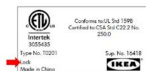
Label attached to the LOCK electrical lamp housing