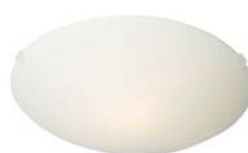
IKEA LOCK ceiling lamp