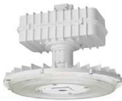
Lithonia JHBL LED Fixture

To report a dangerous product or a product-related injury go online to www.SaferProducts.gov or call CPSC's Hotline at 800-638-2772 or teletypewriter at 301-595-7054 for the hearing impaired. Consumers can obtain news release and recall information at www.cpsc.gov , on Twitter @USCPSC or by subscribing to CPSC's free e-mail newsletters .