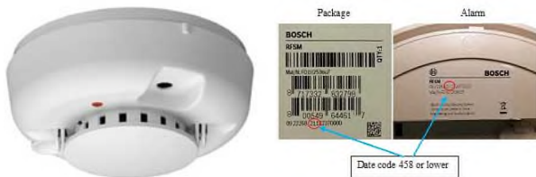
Recalled Bosch Security Systems Radion Wireless Smoke Alarm

To report a dangerous product or a product-related injury go online to www.SaferProducts.gov or call CPSC's Hotline at 800-638-2772 or teletypewriter at 301-595-7054 for the hearing impaired. Consumers can obtain news release and recall information at www.cpsc.gov , on Twitter @USCPSC or by subscribing to CPSC's free e-mail newsletters .