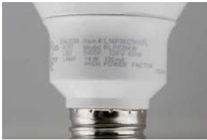
LED 14 watt PAR38 Wet Location Item Number Location